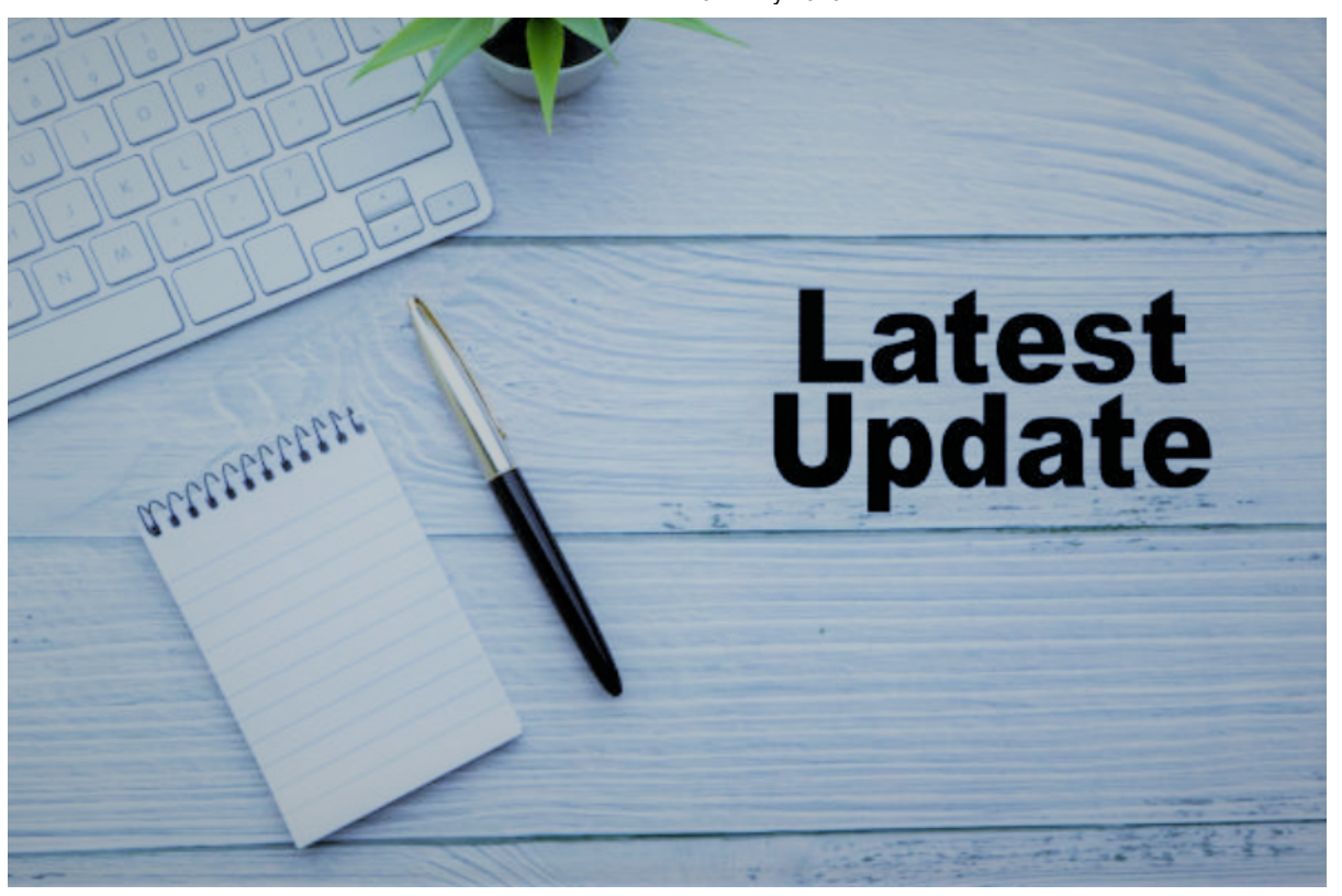
The CoC is holding an election for members to fill even-numbered seats for a 4/1/2025 through 3/31/2027 term.